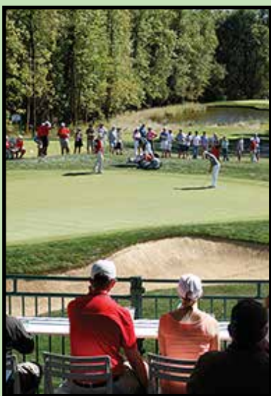
Fans enjoy the WinCo Foods Portland Open.

• The Cambia Portland LPGA Classic will feature the top players from the LPGA Tour at Columbia Edgewater Country Club with newly rescheduled dates of Sept. 17-20.