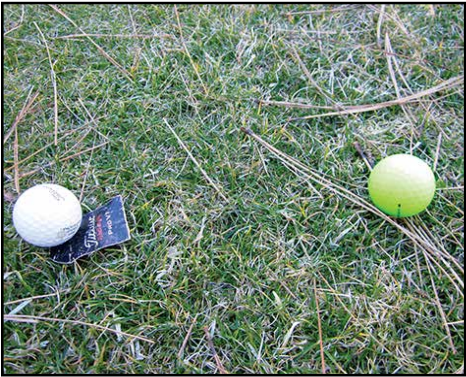
There are two different rules apply to these two golf balls in a similar place on the golf course.

You are right, sometimes the rules seem arbitrary. The rules of golf operate under two broad