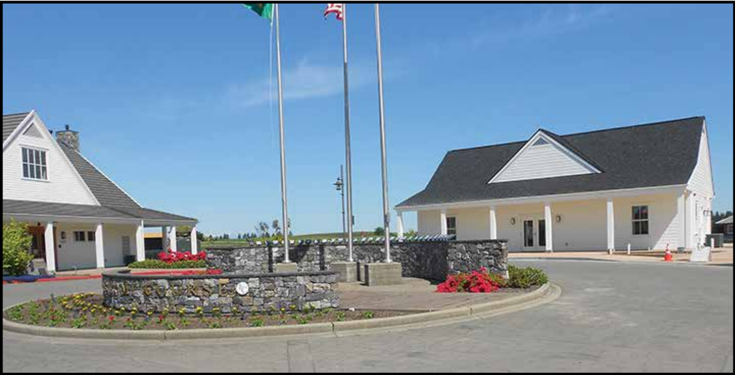
The Home Course, owned and operated by the PNGA, has opened up a new golf shop (above) and saw its old trailer pro shop wheeled away (top).